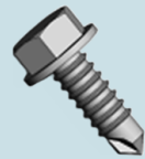
3. SELF-DRILLING SCREW