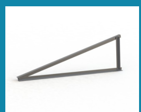
3. TRIANGULAR MOUNTING SYSTEM