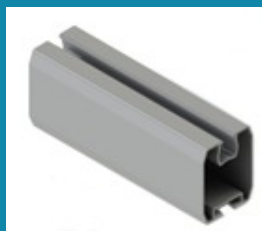
2. PV RAIL