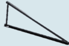
2. TRIANGONAL BASE