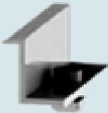
1. END CLAMP