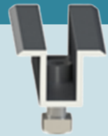
3. MIDDLE CLAMP