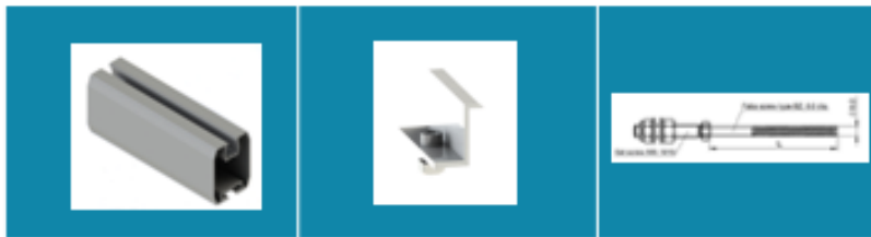
1. PV RAIL