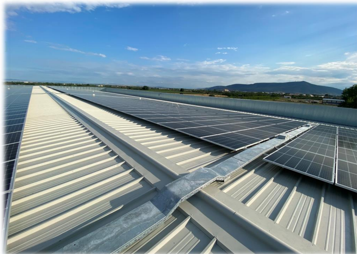
3. BZ TYPE