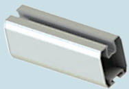
1: PV RAIL